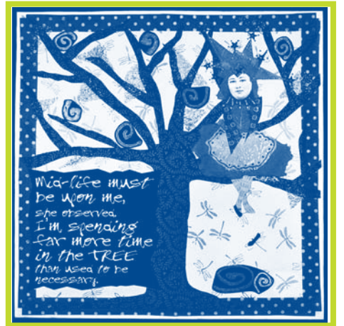
Kay Foley Columbia, MO